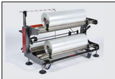
Optional Compact Dual Roll Powered Centerfolder