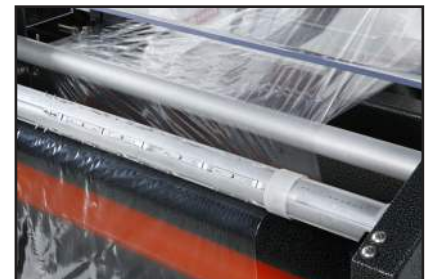
Optional Adjustable Perforator with Brush Roller