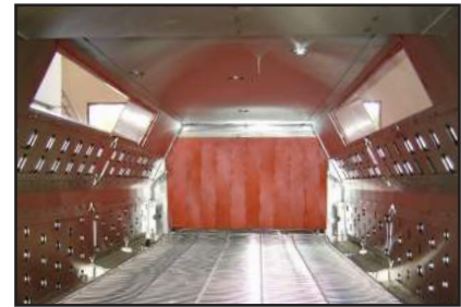
Chain Mesh Belt & Viewing Windows on Both Sides