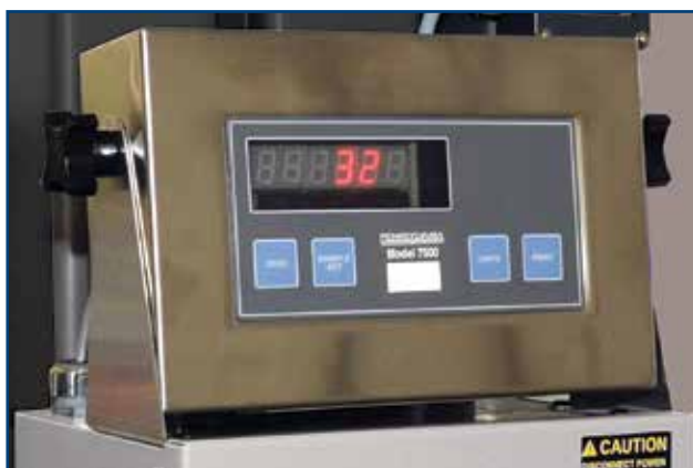
WRAP-N-WEIGH® Operator Controls