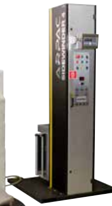
SIDEWINDER LP WNW