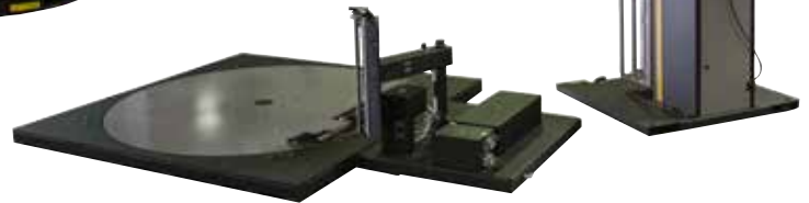
POWER SERIES LP WNW