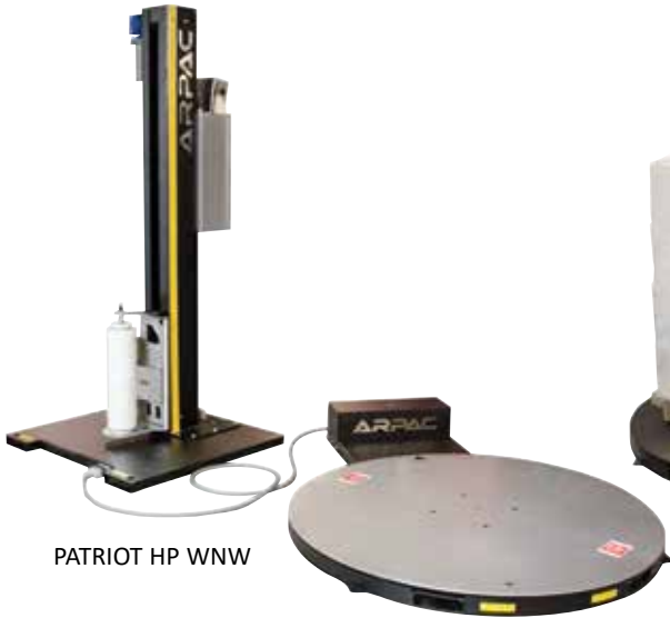
PATRIOT HP WNW